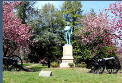
General Winfield Scott

Back in 1811, our young nation made a "Promise" to care for its older and disabled veterans. This would be repayment for their sacrifices in defending liberty. At last, two homes were built: the U.S. Naval Asylum (1834) and the U.S. Military Asylum (1851). The Naval Asylum provided a home for retired sailors in Philadelphia until 1976 when the home was relocated to Gulfport, Mississippi. General Winfield Scott, a hero of the Mexican-American War, provided funding to Congress to open a home in Washington D.C. for old and infirm soldiers. In 1991 both retirement homes joined forces and became the Armed Forces Retirement Home.