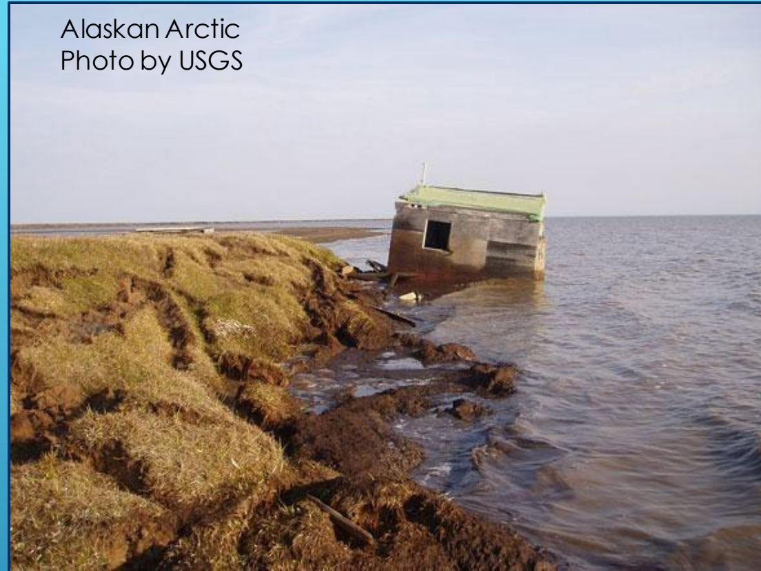
Alaskan Arctic